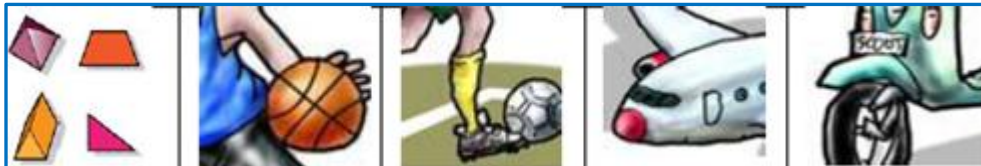
Shapes and Solids 2