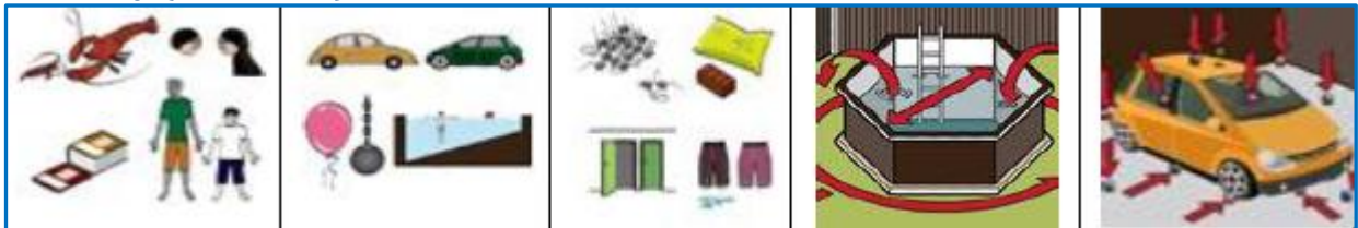
Common adjectives 1